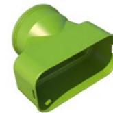
AE55SC distribution box adapter